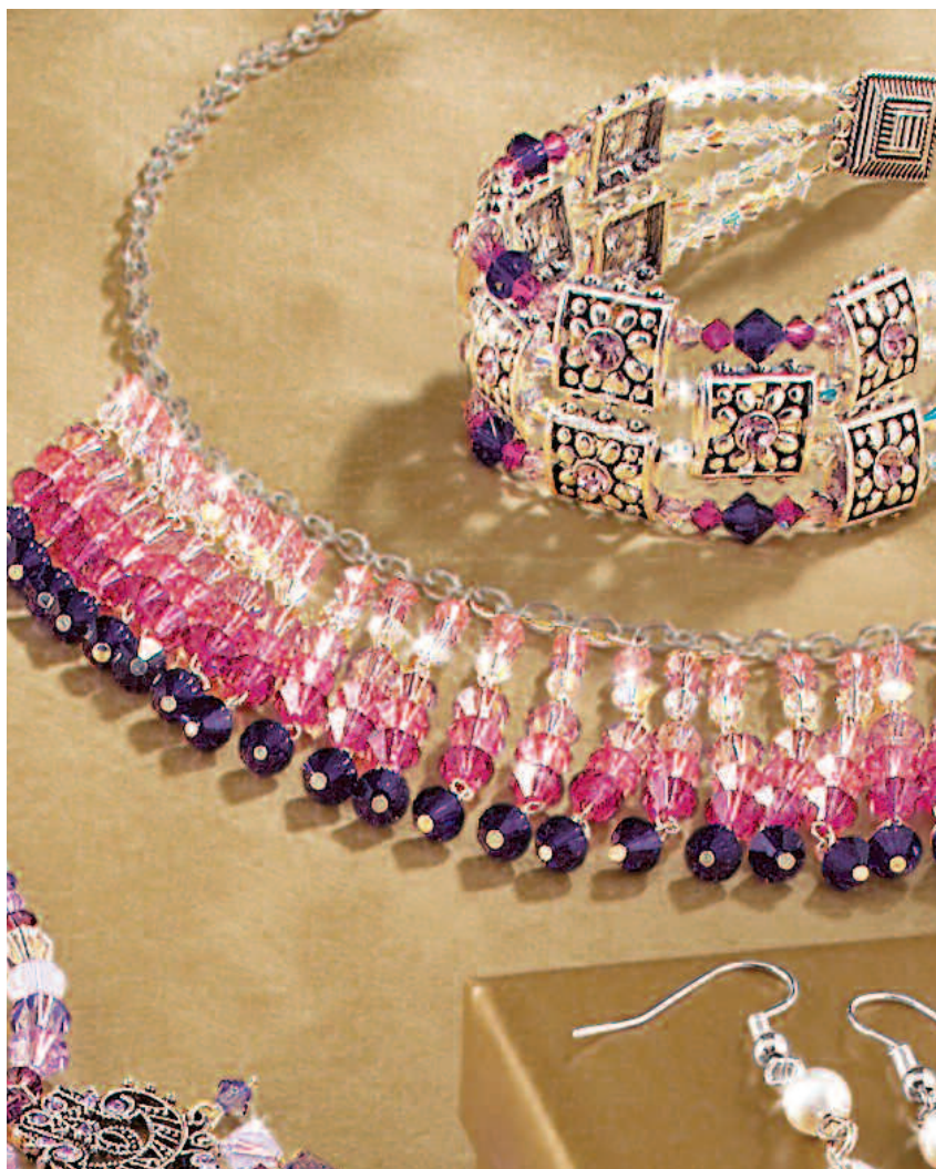
fuchsia dangle necklace