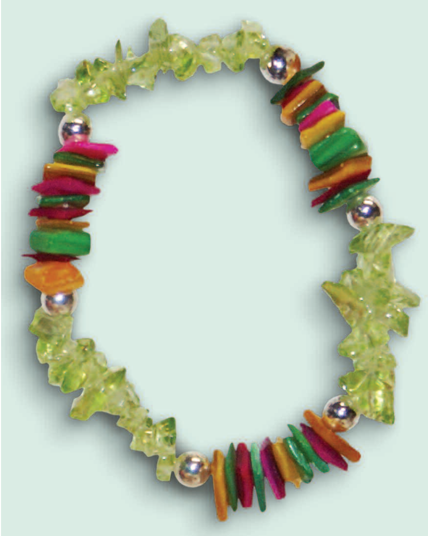
peridot & silver stretch bracelet

Crafts. Discover life's little pleasures.