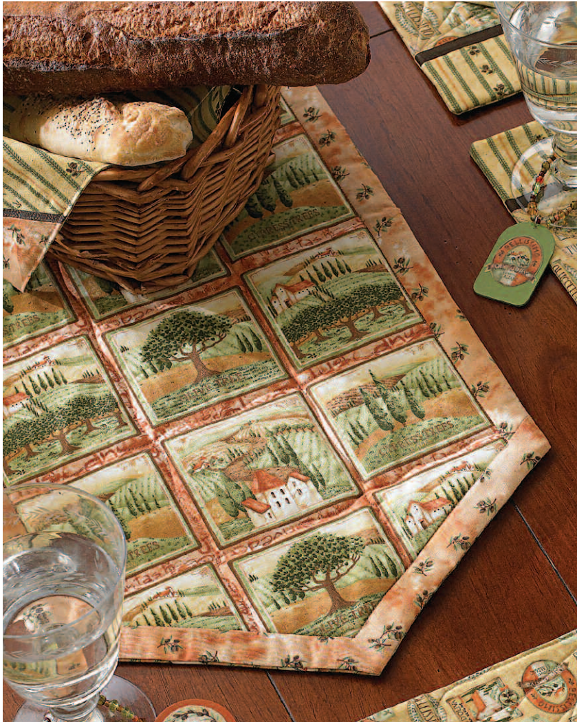
tuscany table runner

Crafts. Discover life's little pleasures.