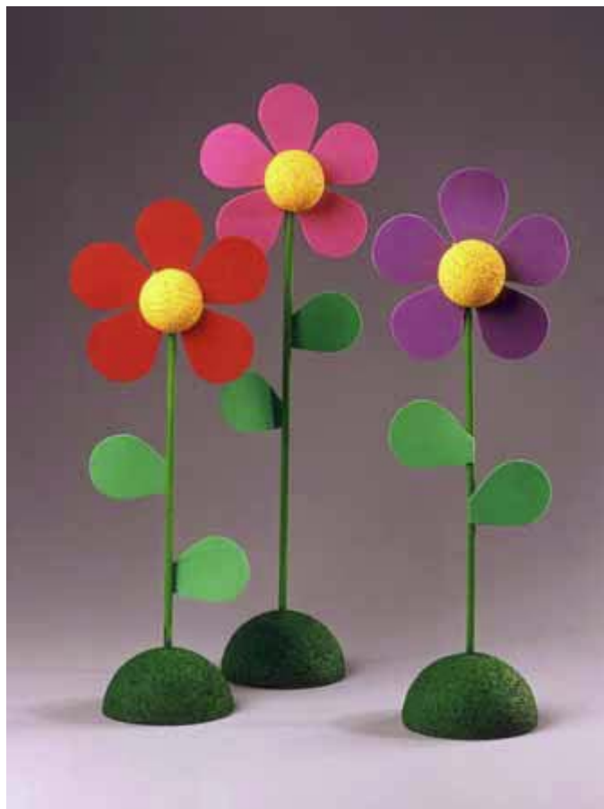
fun and funky flowers