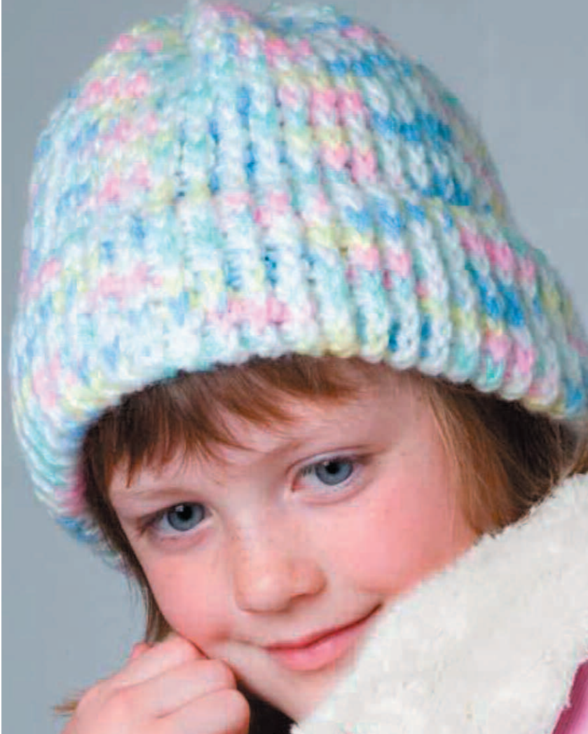
knifty knitter™ loom hat