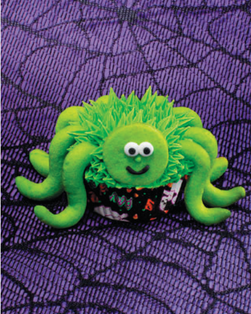
creepy cupcake crawlers