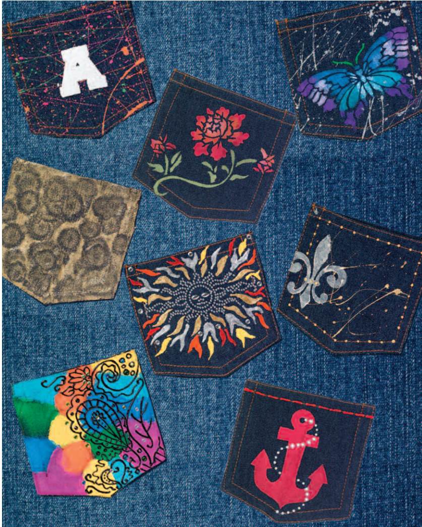
fabric painting techniques

Prewash fabric to remove sizing. Do not use fabric softener. Follow bottle instructions for garment care.