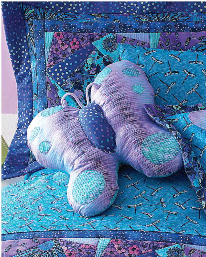
tiffany butterfly pillow