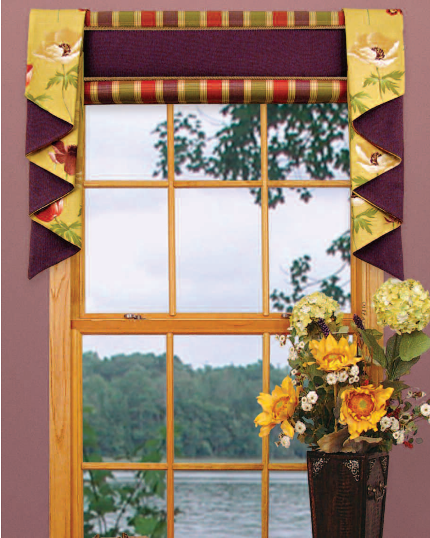
deco wrap® no-sew cornice