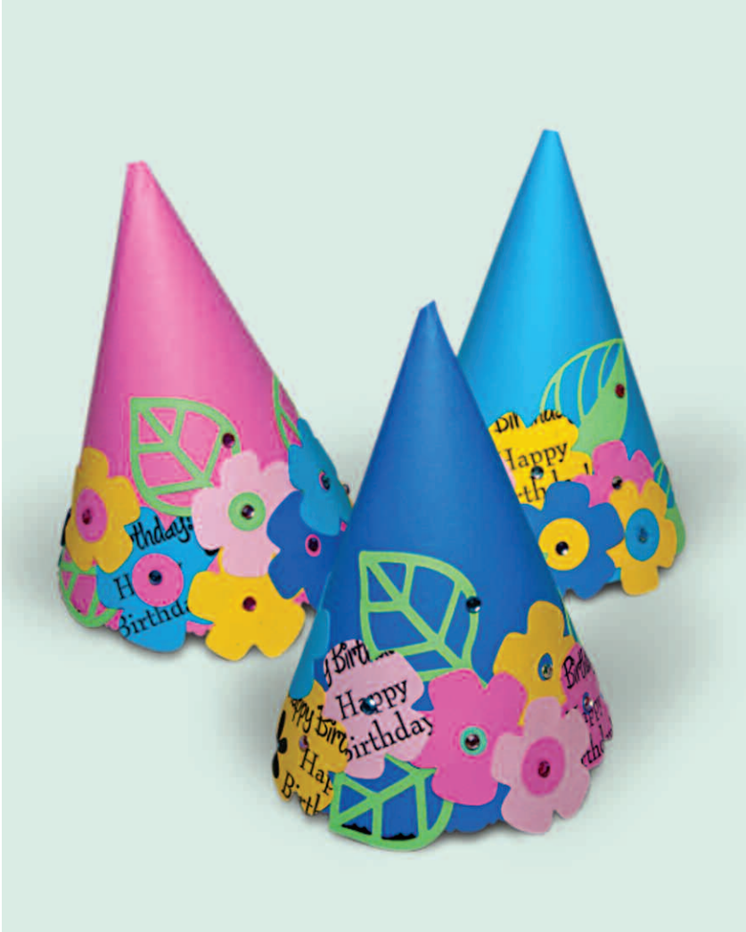
festive flowers party hats

Crafts. Discover life's little pleasures.